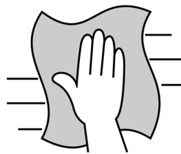
Damp cloth/paper towel