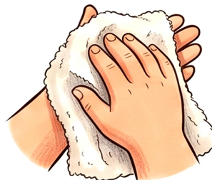
Dry hands thoroughly with towel