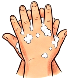
Back of hands