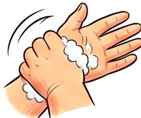
Rotationally rub wrists