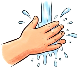
Wet hands with water