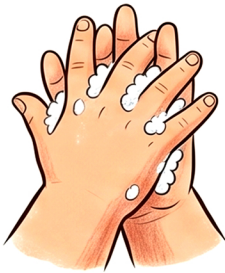
Palm to palm fingers interlaced