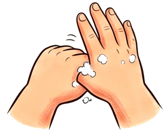
Base of thumbs