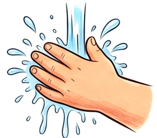
Rinse hands with water